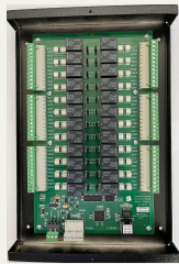
Primis Relay Encryption Bridge - Elevator Control