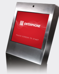
Enterphone Kiosk FR-50-25-13-AD2M