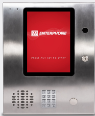
Enterphone iQ FR-50-21-50-AD2M