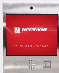
Enterphone 19 FR-50-21-125-AD2M