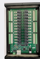
Enterphone Relay Encryption Bridge PN: FR-50-24-E