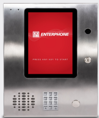
Enterphone IQ FR-50-21-50-AD2M