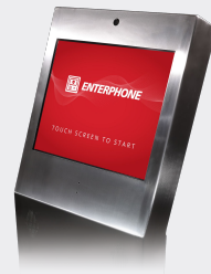
Enterphone Kiosk FR-50-25-13-AD2M