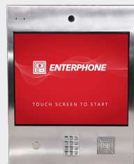
Enterphone 19 FR-50-21-125-AD2M